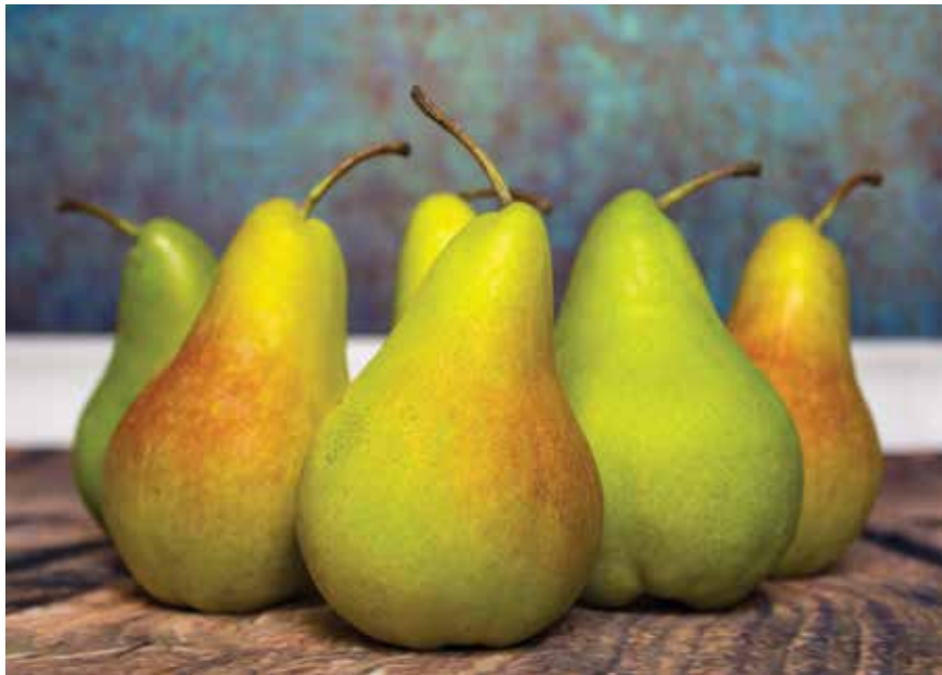
PEARS Alberto Gutierrez

I got out of school, got on a school bus, and rode into Washington, D.C. to the national theater, into the wonder of red velvet chairs, the darkened room, and watched the lights come up on Leonard Bernstein and the young people's orchestra.