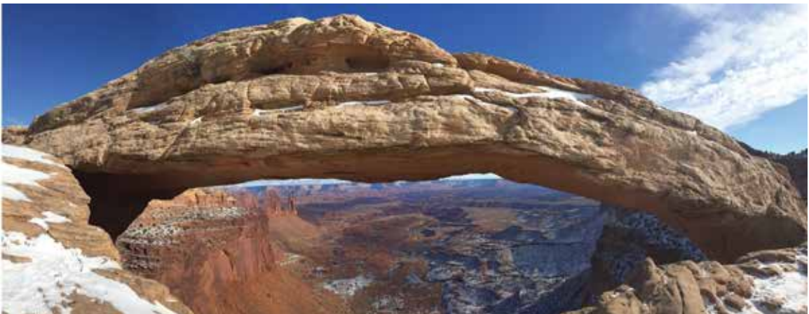
WINDOW TO THE WORLD BELOW Nirisha Garimella