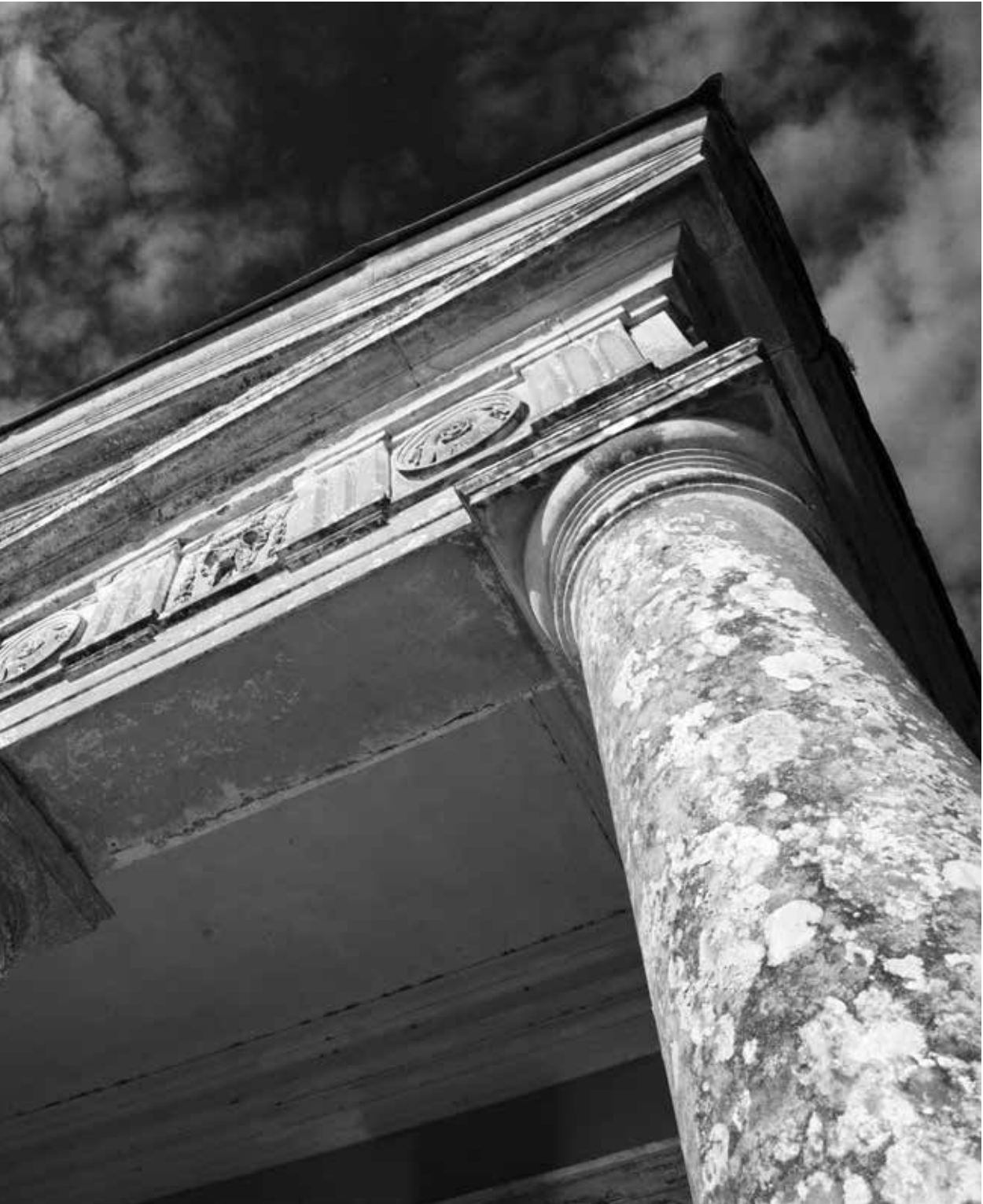
TEMPLE Craig Erickson