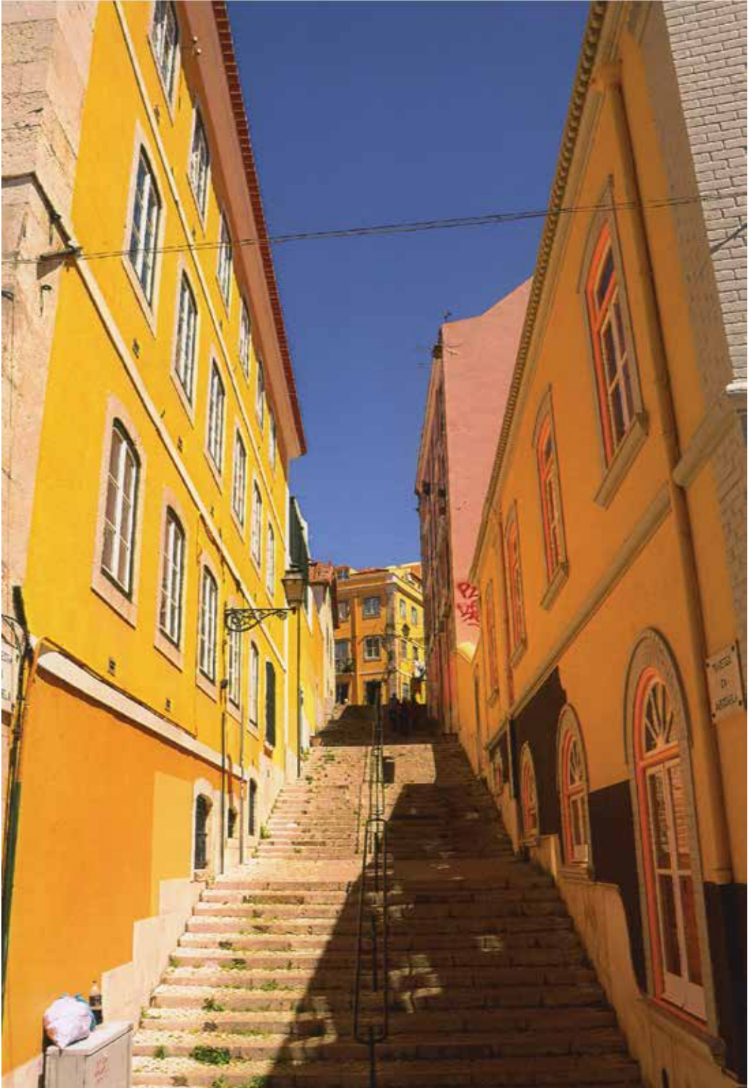
SINTRA PORTUGAL Amanullah Khan