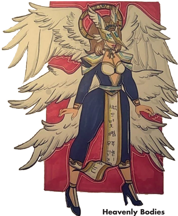
Heavenly Bodies Erick Mendoza

The waters ran red as bodies washed ashore, Roman cities burnt to the ground, Fires raged for days, As did Boudica's anger.