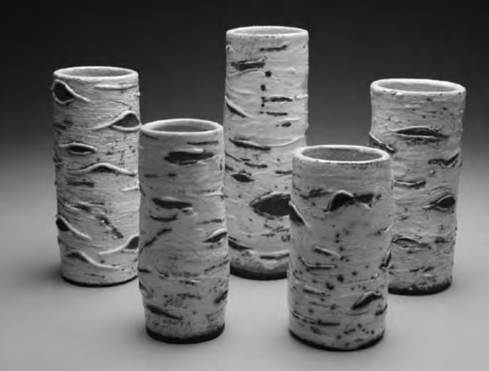
Pottery Eunice Bridges