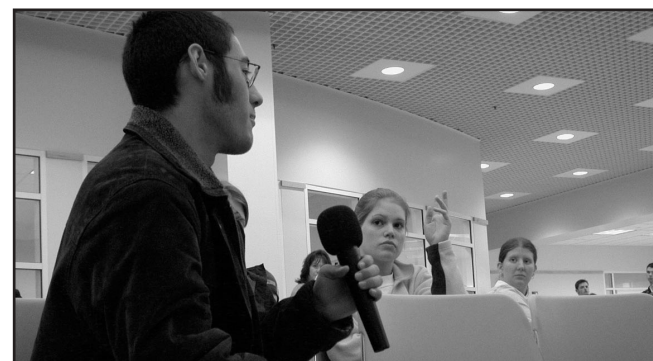
Students debate state budget, tuition and abortion at an open forum at PRC during "Civic Engagement Week."