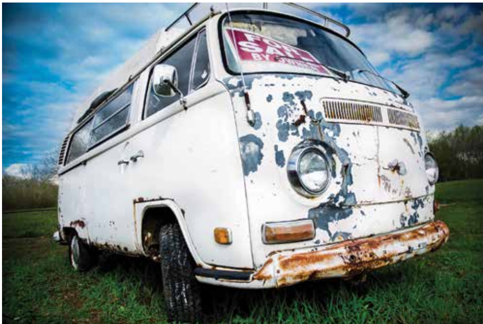
SHAGGON WAGGON Hayley Earnest

Driving over the bridge Is more like flying a plane Or Christmas shopping on Black Friday. It is the crossroad for six streets. Nobody is sure where to go, Especially the first in line, The first time. Right is the Shopping Center. The entrance to the overpass has moved left. The street goes straight ahead-- Or you can drive over a curb Into empty space.