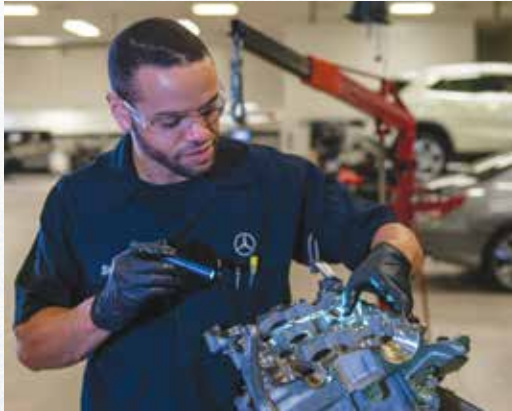
An automotive service technician with Ewing Automotive Group inspects a Mercedes-Benz engine.