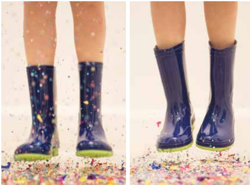
STOMP Kelly McNett

Like Trump’s influence over a particular society, a single person can become the “voice,” altering society’s norms. When this occurs, the balance of power between