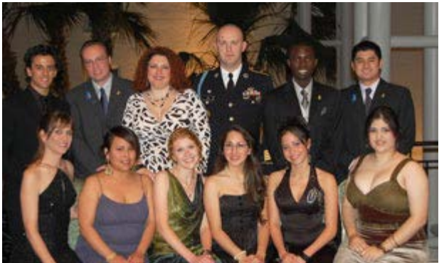
Collin College's Phi Theta Kappa – Alpha Mu Tau chapter