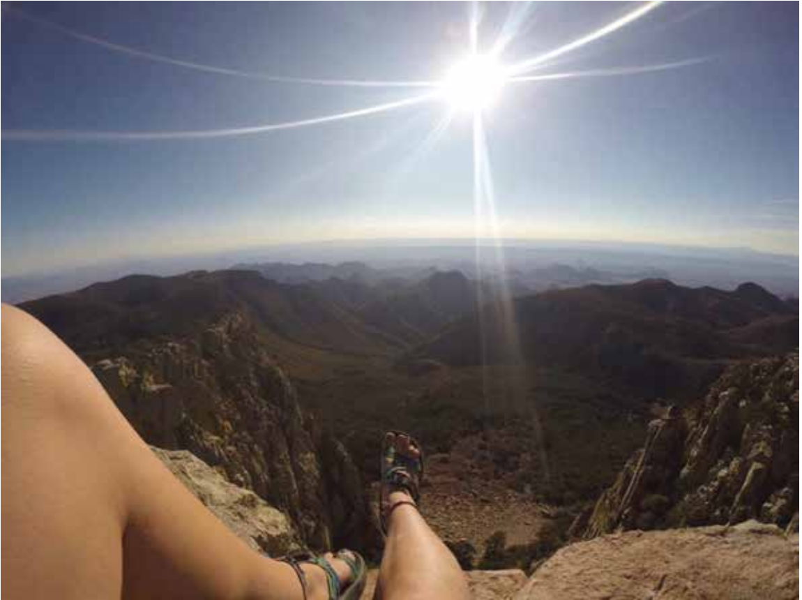
EMORY PEAK Shelby Hotz